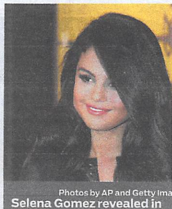
Selena Gomez revealed in

"Lupus comes with many manifestations. That is why often there is delay in diagnosis. For example hair loss — everyone in Dubai complains of hair loss. Fatigue is